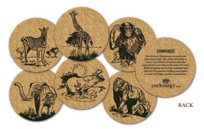
Safari / #414 Zebra • Giraffe • Chimpanzee Elephant • Hippopotamus • Gorilla