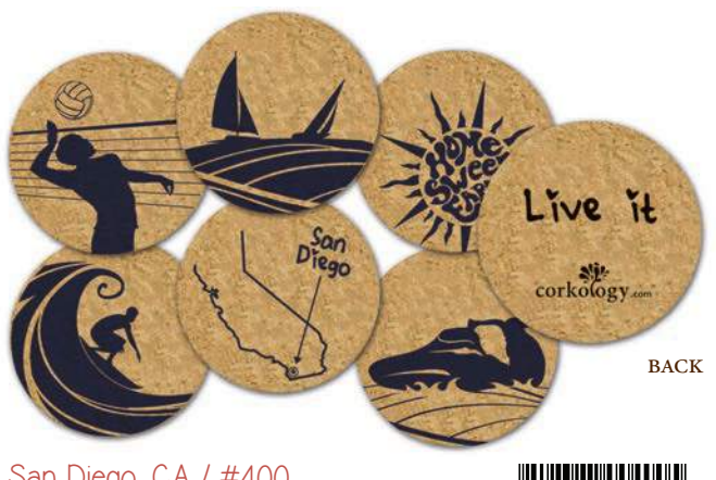
San Diego, CA / #400 Volleyball • Sailboat • Sun Surf • San Diego • Jetski