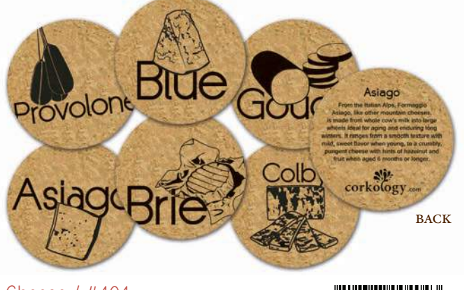
Cheese / #404 Provolone • Blue • Gouda Asiago • Brie • Colby