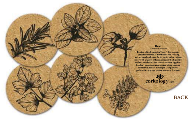
Herbs / #437 Rosemary • Basil • Oregano Flat-leaf Parsley • Cilantro • Lavender