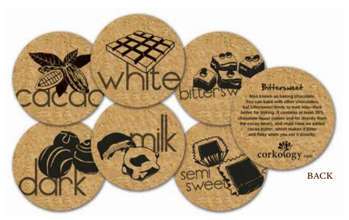
Chocolate / #403 Cacao • White • Bittersweet Dark • Milk • Semi-sweet