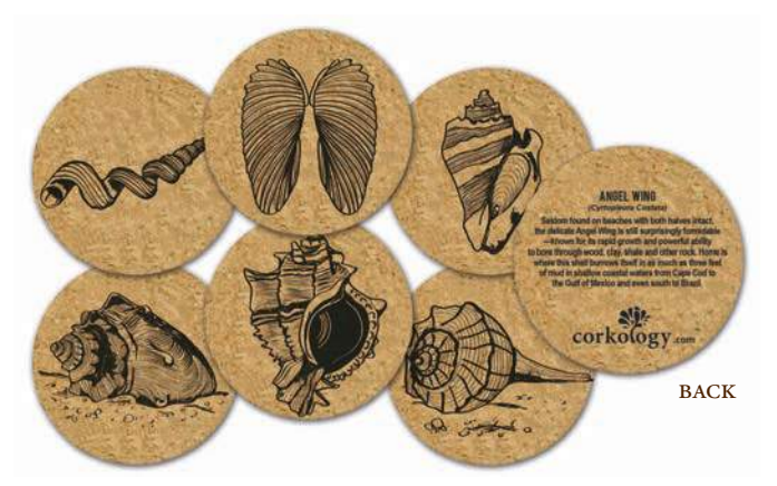
Seashells / #420 Lightning Whelk Florida • Angel Wing Fighting Conch • Worm Shell Apple Murex • King's Crown