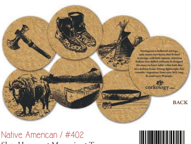
Slate Hammer • Moccasins • Tee-pee Bison • Canoe • Hand Drums