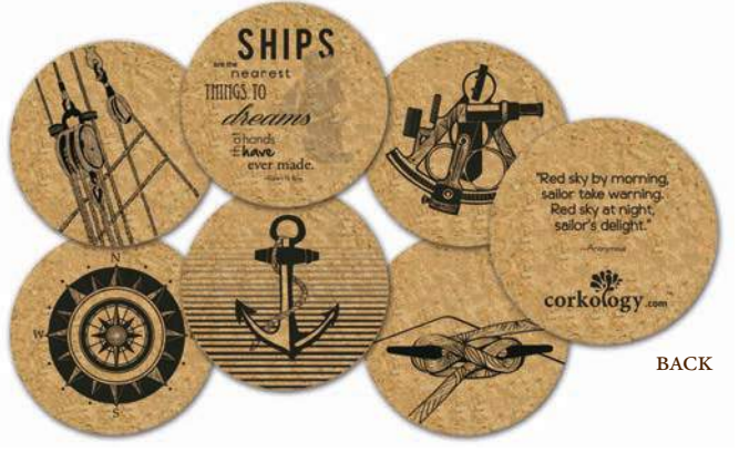
Nautical / #424 Sextant • Sailors Proverb Block & Tackle • Compass Anchor • Cleat Hitch