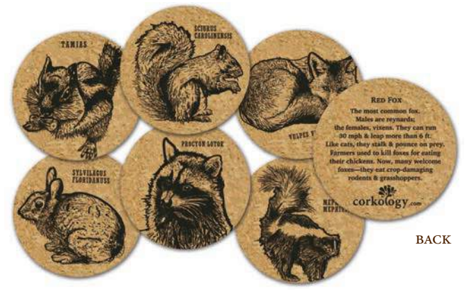
Urban Critters / #439 Chipmunk • Squirrel • Red Fox Rabbit • Raccoon • Skunk