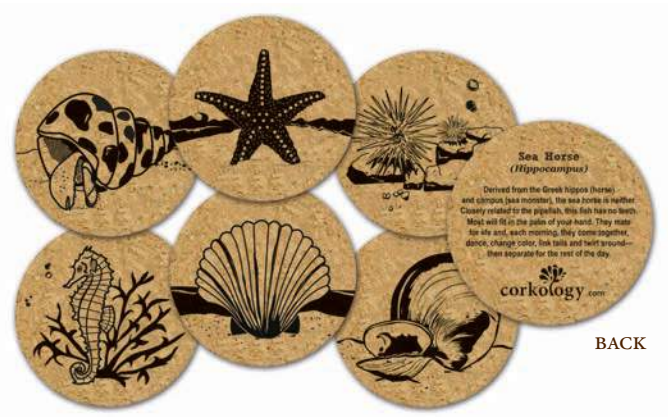
Marine Life / #381 Scallop • Starfish • Mussel Sea Horse • Sea Urchin Hermit Crab