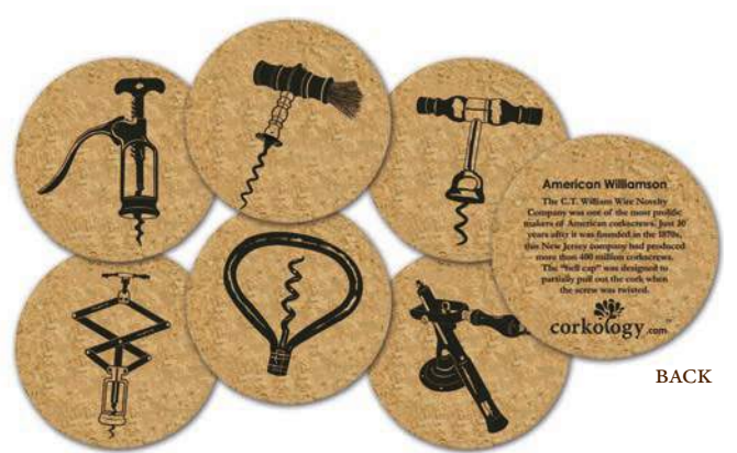
Wine Opening Devices / #406 Henshall • Peerless • American Williamson Le Parfait • Merritt Bar • Copley Bow