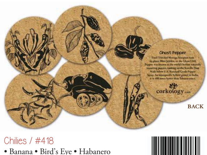
• Banana • Bird's Eye • Habanero Ghost •Jalapeño • Arbol